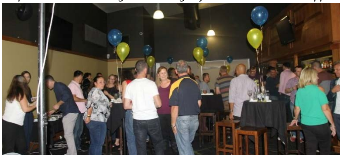
Warming up the tonsils pre show with a few bevies!