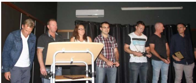
Corporate Partners being acknowledged for their tremendous support.